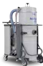
T22 - T40 - T40W - T75

1.5 and 2.2 kW power, suitable for the collection of welding flux. These systems are indispensable for flux recovery in submerged arc welding installations.