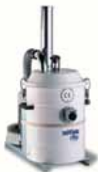
040/22 - 100/28-150/36