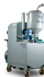
OIL 440E - OIL 675E